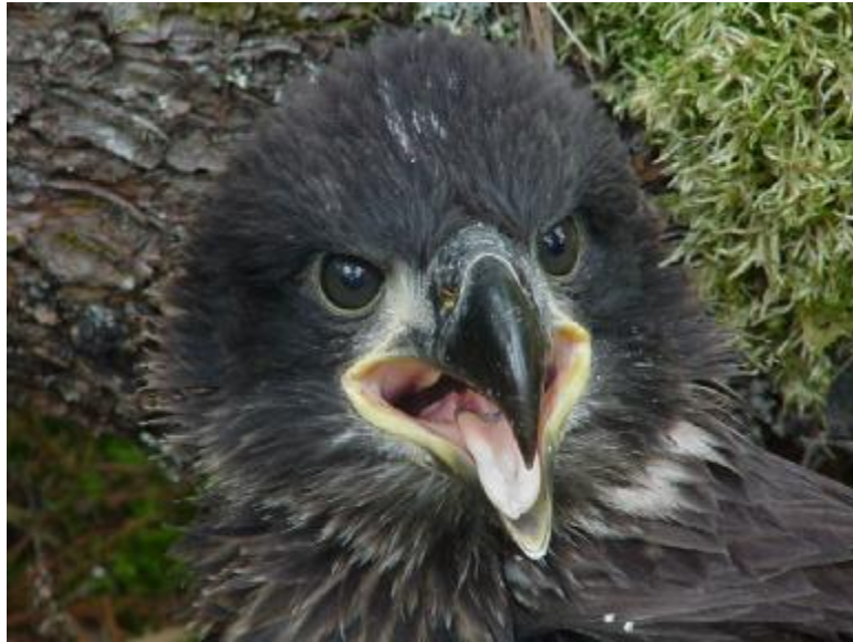
(Juvenile eaglet)